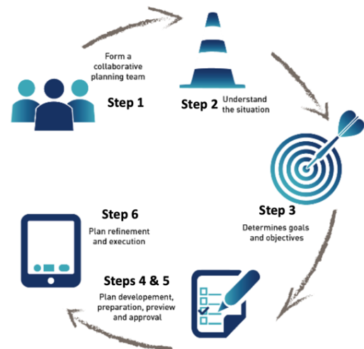
Figure 1– Planning Cycle

In Step 1 – Form a Collaborative Planning Team , potential planning team members are identified. In Goochland County, the Goochland County Emergency Planning Team